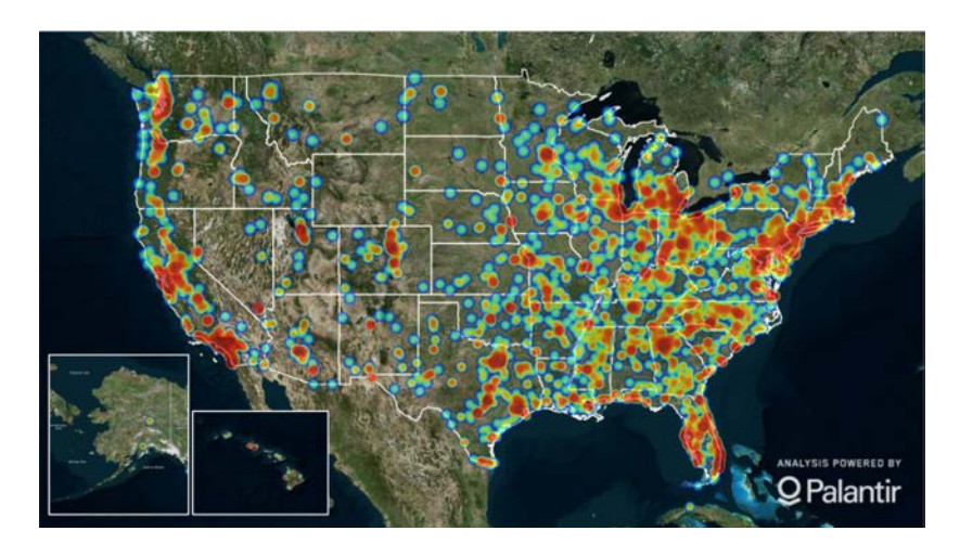
Image 2: Polaris Project 2018 National Human Trafficking Hotline Heatmap

'awareness raising' messaging. Polaris' 'Heatmap' of trafficking cases, for example, creates the impression of an omnipresent trafficking threat as well as certain hotspots that should be targeted.